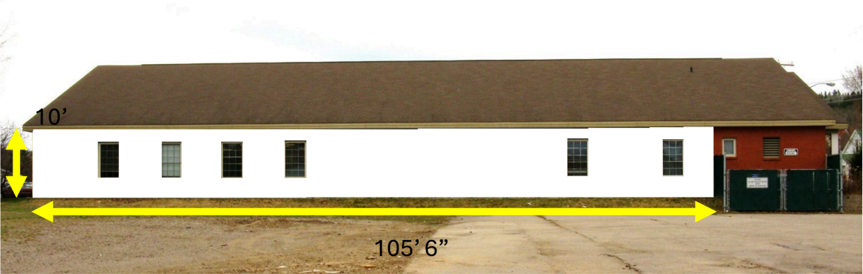
Figure 1. Location #1

Location #1 - This mural will be located on the Sussex Regional Library, located at 46 Magnolia Ave, Sussex, NB. Its size is 105' 6" by 10' less 6 windows (just under 1000 square feet). The wall is made of red brick and the selected artwork will be created directly onto this surface, on location. Please see the image below (Figure 1. Location #1) for detailed dimensions.